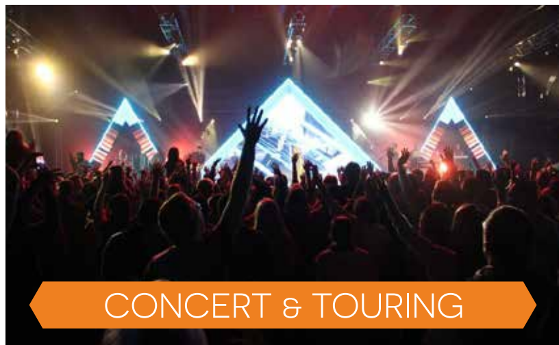
CONCERT & TOURING