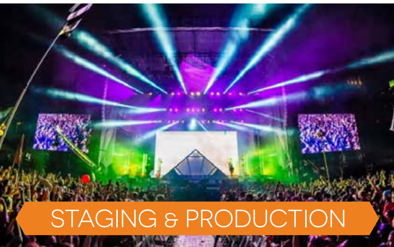
STAGING & PRODUCTION