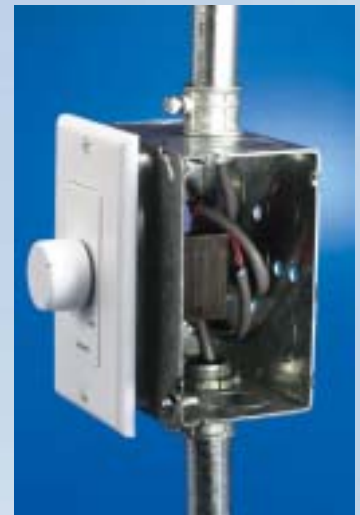
Compact LVC Series mounts in E.O. Boxes with a minimum depth of 2.125"

*** 2-gang and multi-gang switch boxes noted are for use with Decora-style units in multi-device installations (multi-gang trim plate by others).