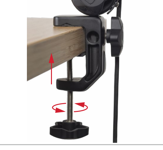
Push the clamp all the way onto the desk edge. Then, fasten the clamp to the desk by turning the knob tightening it in place.