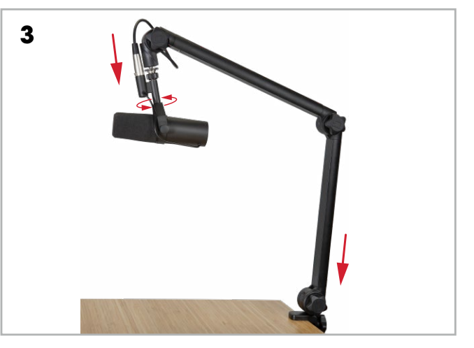
Insert the arm into the hole at the top of the clamp. Then, insert and tighten the mic holder on the top of the boom.