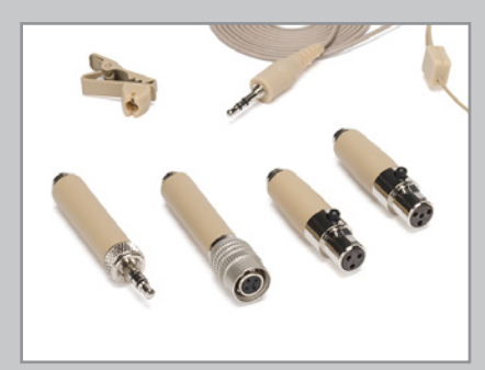
Includes four different transmitter adapters