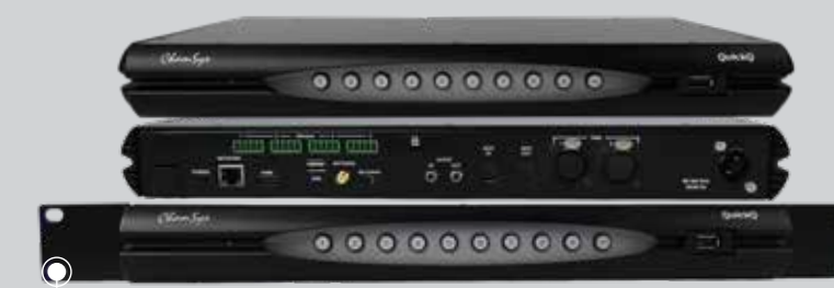
Shown with included rack ears.