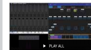
1 QuickQ: Console Layout ChamSys

There's no need to have any prior experience with lighting to use QuickQ. Explore the ChamSys QuickQ Training Library at: http://bit.ly/QuickQTraining to access informative prompts and videos that will help you start programming in no time!